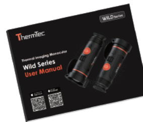
User manual (x1)