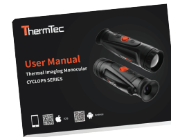
User manual (x1)