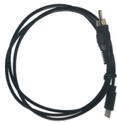
Video output cable (x1)