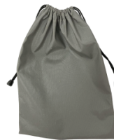
Carry bag (x1)