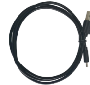
USB cable (x1)