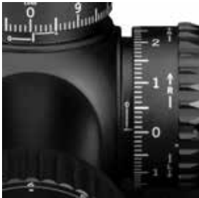
Aligning “0” marks.