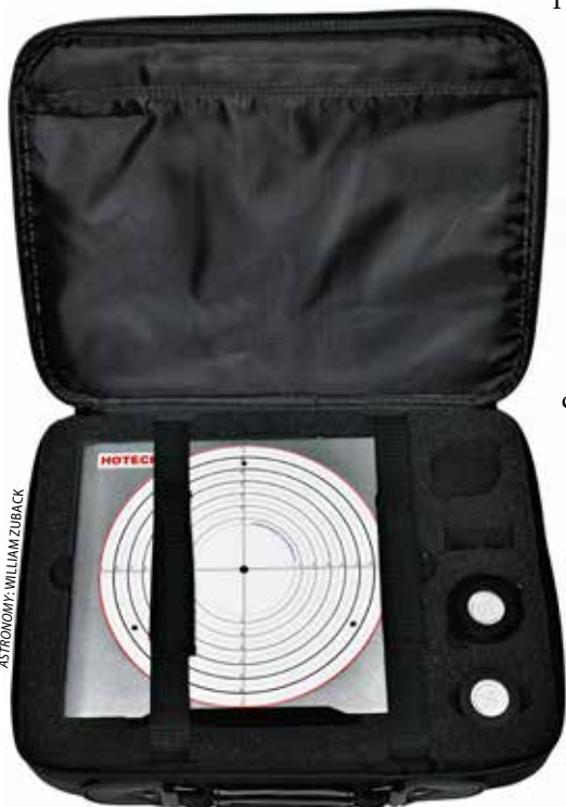
The entire kit fits snugly in a padded carrying case.

I found that the HOTECH Advanced CT Laser Collimator did a consistently good job of aligning the optics in my scope. If you or your astronomy club are interested in getting the most out of your SCTs while saving valuable observing time, I recommend checking into this product. ☺