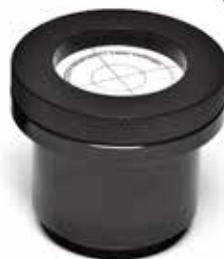
The collimator comes with either HOTECH's 1¼" or 2" Reflector Mirror and an adjustable tripod head.