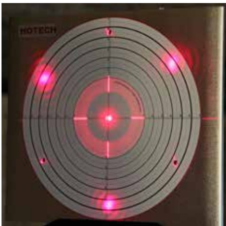
The light from the lasers enters the telescope and returns to the target. At this point, you'll know if the scope's alignment needs tweaking. TOM TRUSOCK