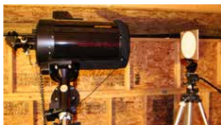
The author photographed his collimating setup.

Wouldn't it be nice to have an easy way to collimate an SCT during the day? Well,