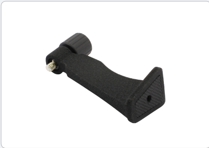
ATA - Tripod Adapter